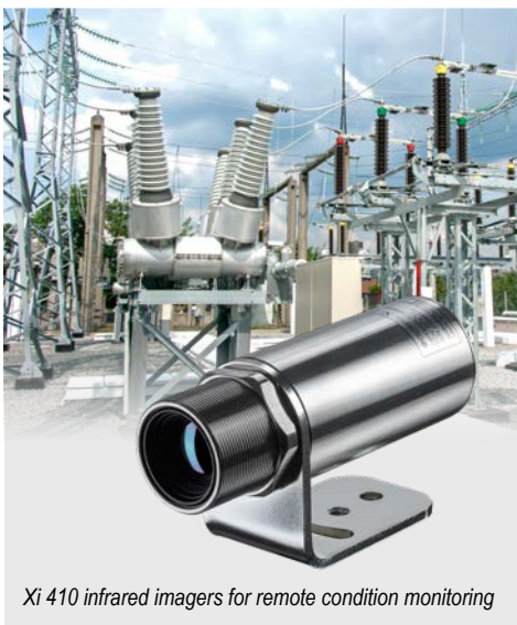
Xi 410 infrared imagers for remote condition monitoring